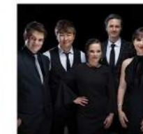
The Idea of North