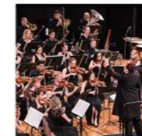
The Metropolitan Orchestra